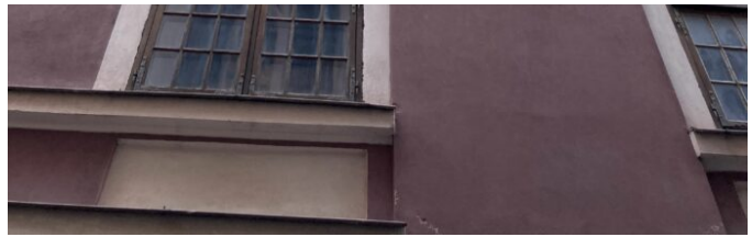
Photo of a warehouse in Riga old town.

cobbled old streets and told us a lot about the history of the port city as a trading center. He also talked about buildings and the original purpose of their floors; only the lower floors were used for living, the upper floors were intended for storage, because the river that runs through the city often flooded and water rose up into the houses. There were winches outside the houses, which were used to lift the goods to the upper floors. Riga has been an important trading port since the 12th century.