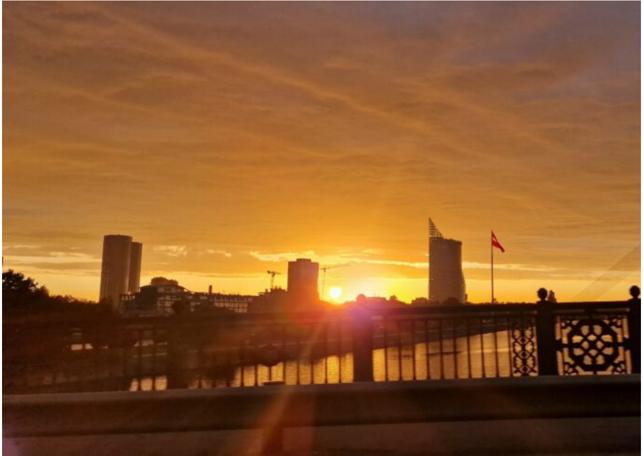
Final evening in Latvia.

But if travel expands, then I suppose it is fair to say that studying abroad blows those horizons wide open.”